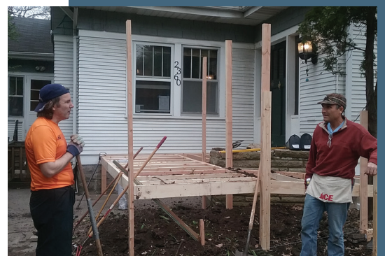
The architect and the carpenter build the ramp