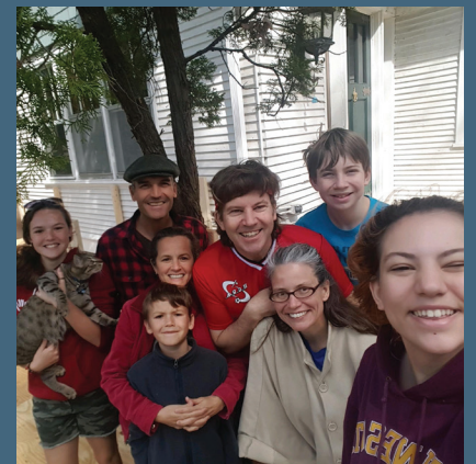
The whole quarantined family & friends